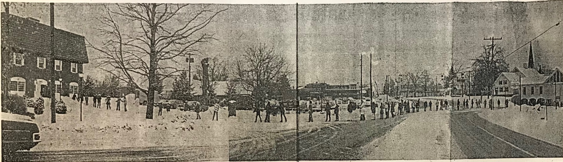
Frostbite weather didn't stop Windsor 'book brigade' from moving 35,000 volumes from old to new library. Story on Page 13.